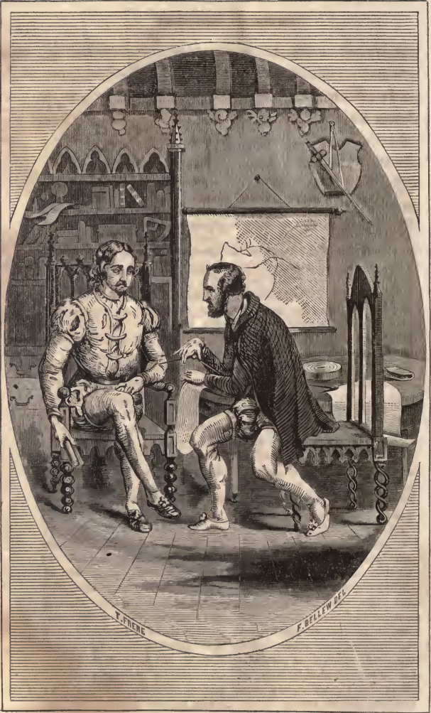
CONVERSATION BETWEEN AMERICUS AND COLUMBUS.